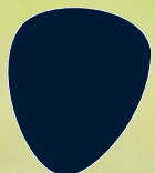
RPS-8 True Navy