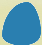
RPS-11 Sky Blue