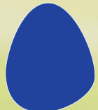
RPS-7 Royal Blue