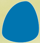
RPS-12 Turquoise Blue