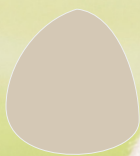
RPS-3 Desert Sand