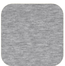
AP-11 Grey Melange