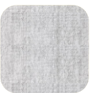
AP-10 White Melange