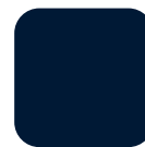
AP-7 True Navy