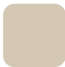
AP-8 Desert Sand